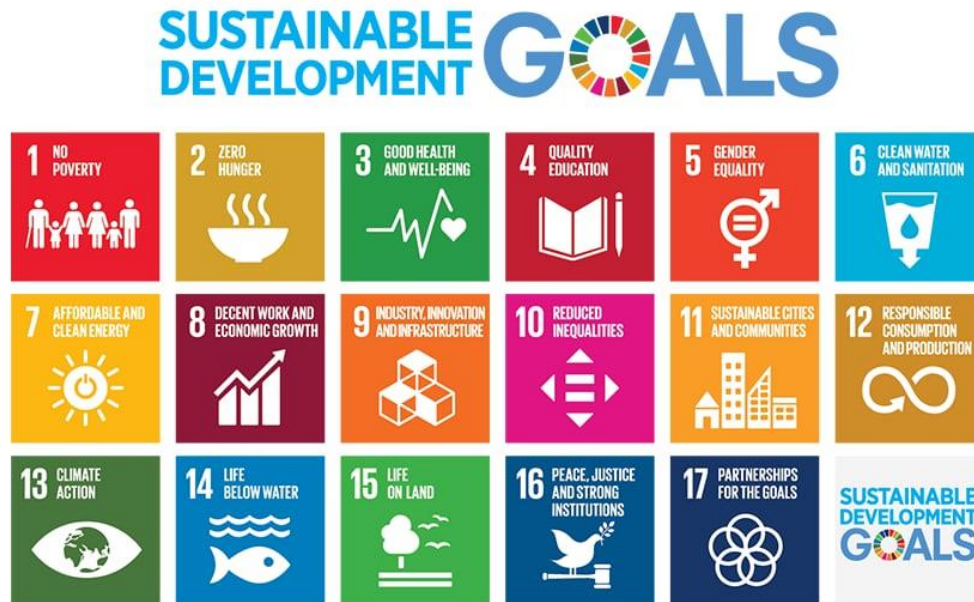
Figure 2: The 17 Sustainable Development Goals (UN, 2015)

Many companies in the wider construction industry assess their sustainability relative to the UN Sustainable Development Goals (SDGs). There are 17 goals with 169 targets to meet by 2030 (Fig. 2); these targets are aimed at governments to meet various social, economic and environmental indicators. Since many of these targets are interconnected the SDGs are also intended to be addressed collectively.